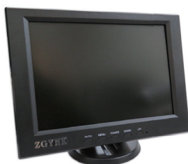
10 inch monitor