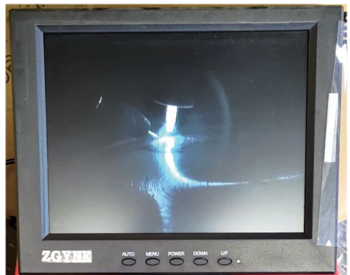
Pulse TIG with filling