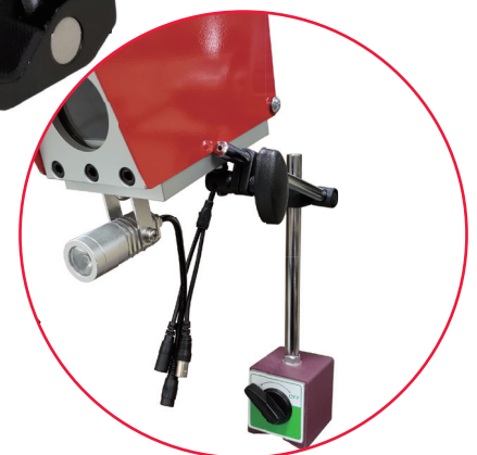
Magnet mounting (optional)