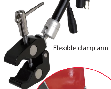
Flexible clamp arm