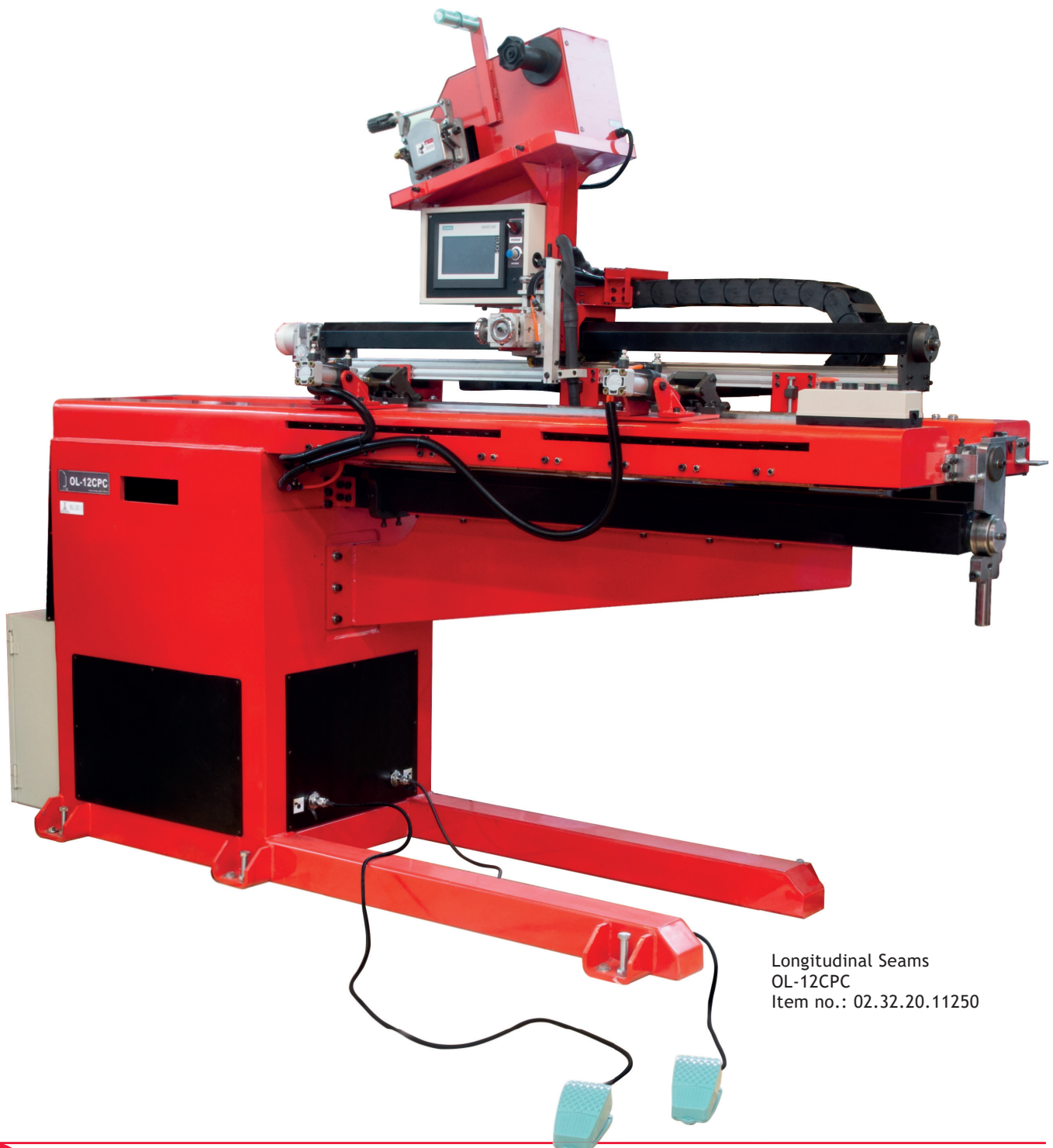
Longitudinal Seams OL-12CPC Item no.: 02.32.20.11250

Which model you choose depends on your weld seam length. Because the OL models are available for workpiece lengths from 460mm to 3060mm, or for workpiece diameters from 65mm to 1000mm.