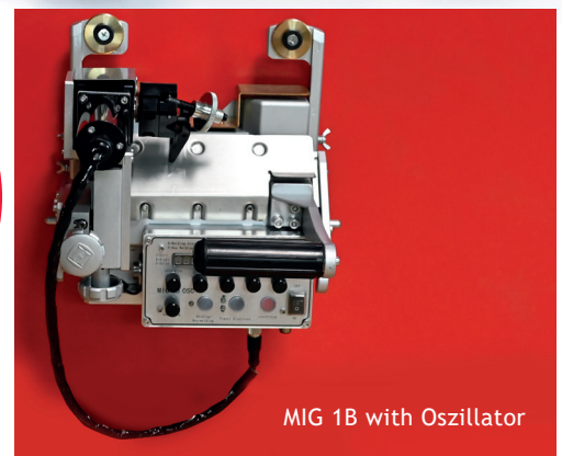
MIG 1B with Oszillator