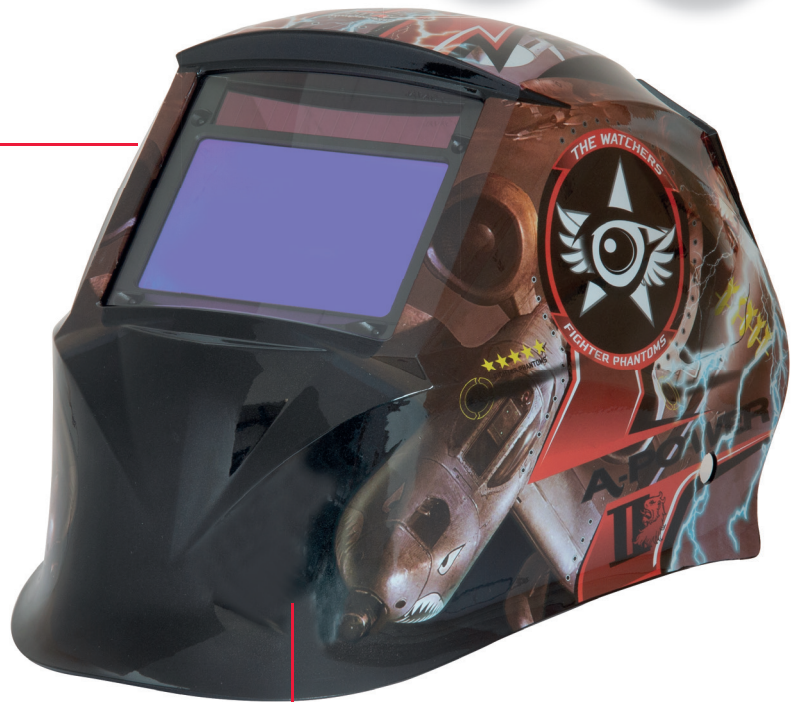
Bestview VIII, graphic Item no.: 31877223 (old:31877223)