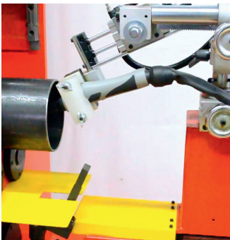
Also for internal welding