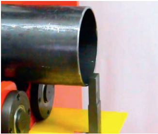
Pneumatic limit stop