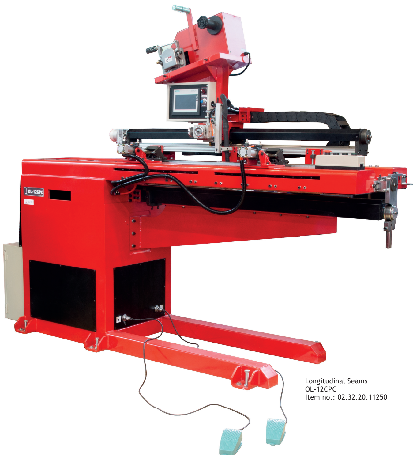
Longitudinal Seams OL-12CPC Item no.: 02.32.20.11250

Which model you choose depends on your weld seam length. Because the OL models are available for workpiece lengths from 460mm to 3060mm, or for workpiece diameters from 65mm to 1000mm.