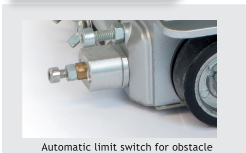
Automatic limit switch for obstacle

Charger, Battery or Power supply, Cable set 15 m,