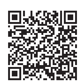
QR code for more Information