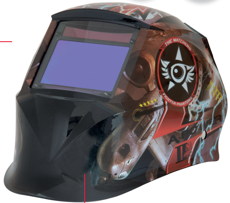
Bestview VIII, graphic Item no.: 31877223 (old:31877223)