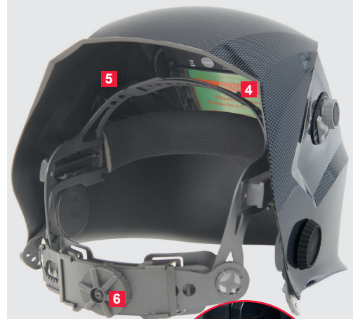
Fig. (5) Battery